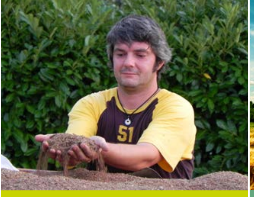
Matteo Bartolini - President of the European Council of Young Farmers